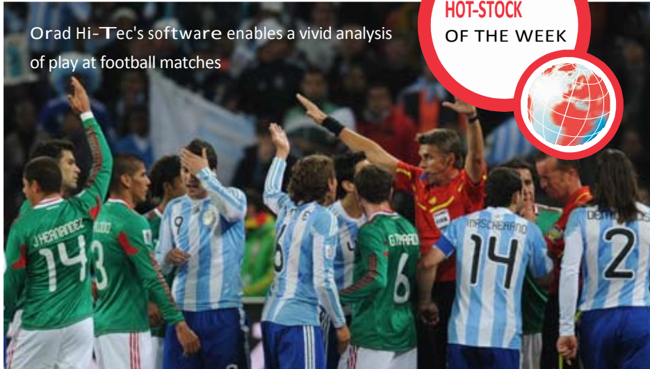
Orad Hi-Tec's software enables a vivid analysis of play at football matches