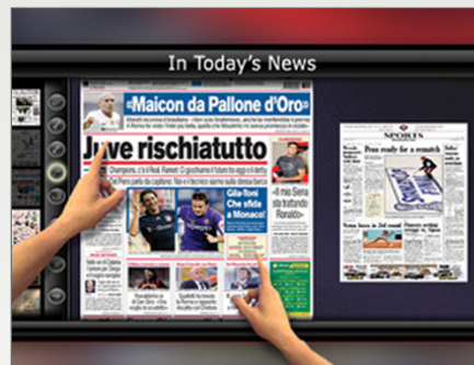
Manipulation of objects